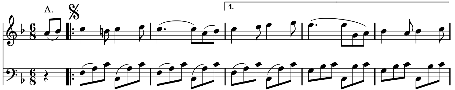
Figure 3. - Ronds, moulinets, queue du chat, chaîne anglaise.